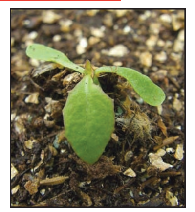
Dandelion at the seedling stage.