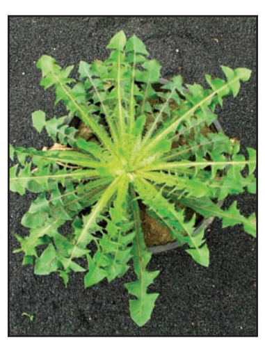
Dandelion at the rosette stage.