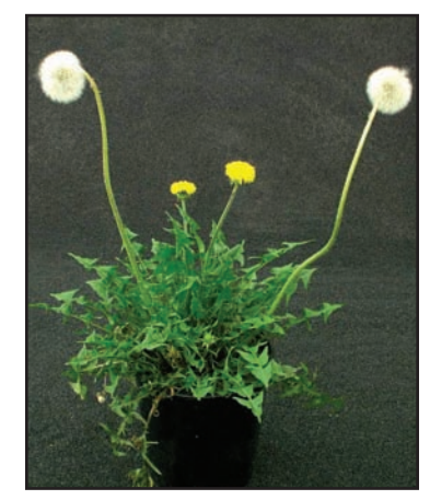
A flowering dandelion plant.